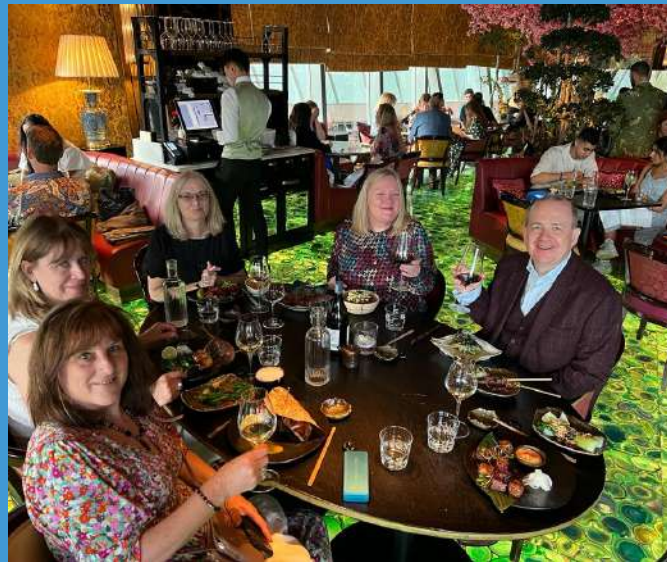
Friendships - local or nationwide

Spice Social is the largest social membership organisation in the UK. There's an incredible range of events, weekends away, holidays and much more, focusing on fun and friendship. Feel comfortable coming on your own, knowing that you're in a group of like-minded people. Check now to see what's on in the Thames Valley & Solent Group, which spans Bucks, Berks, Bristol, Bournemouth, Dorchester, Gloucester and Guildford.